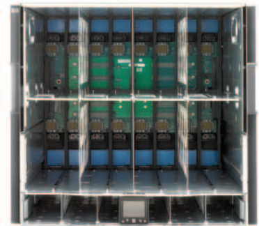
The BladeSystem c7000 enclosure

The BladeSystem c7000 is a larger, modular block of infrastructure that is ideal for bigger data centers. It holds up to 16 different types of server and storage blades, with twice as many interconnect expansion slots available to run nearly any application in a dynamic, high-performance IT environment.